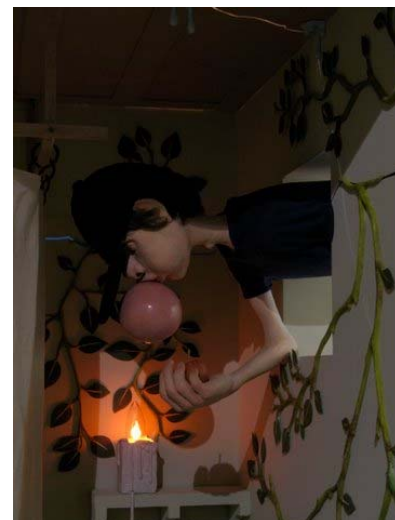
Image: They stand outside installation detail 2010

Exhibition Open: Friday, Saturday, Sunday, Monday, 11am - 5pm